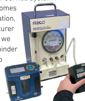
Air-sampling pump calibration

Every piece of equipment we sell also gets logged into our Service System so when the time comes to conduct a calibration, based on manufacturer recommendations, we will send you a reminder hopefully helping to alleviate some of your admin tasks.